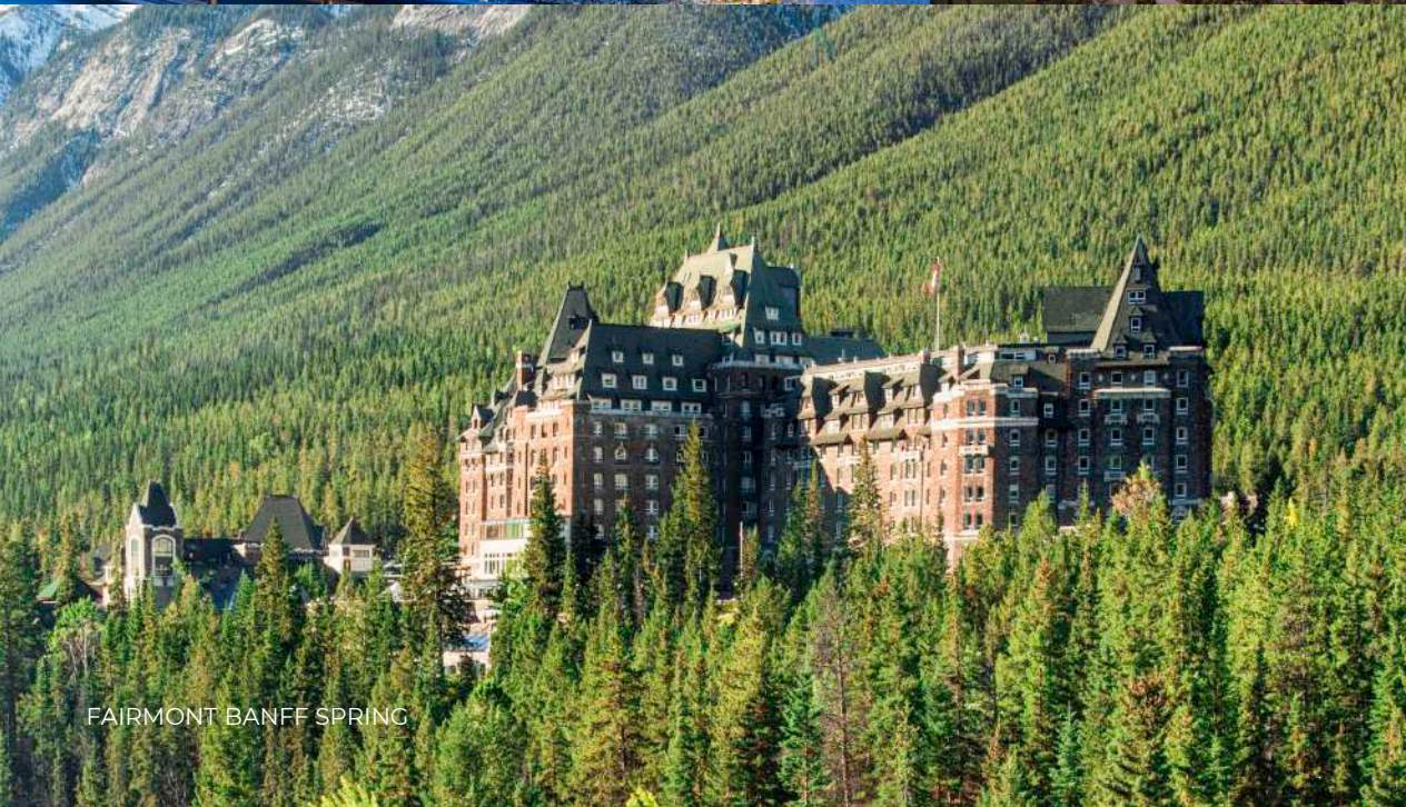
FAIRMONT BANFF SPRING

Fairmont, Raffles and Swissôtel Globally, Sofitel (North America)