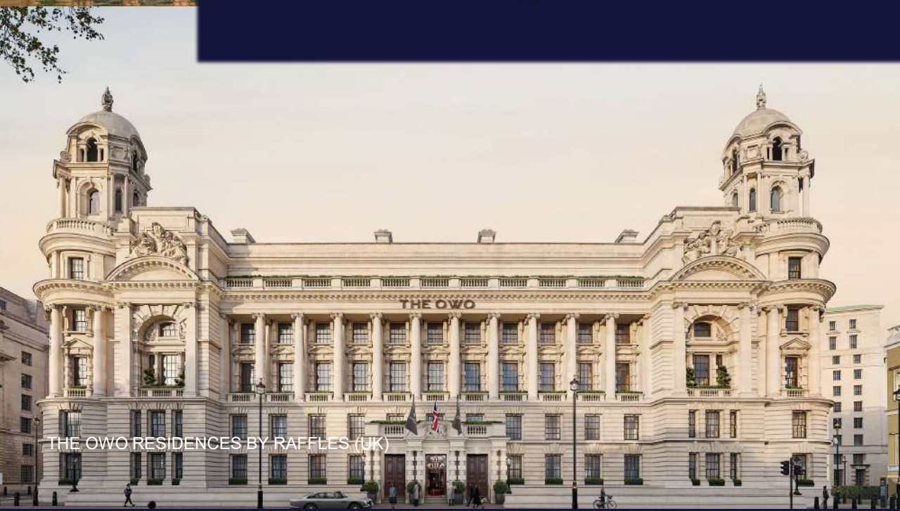
THE OWO RESIDENCES BY RAFFLES (UK)