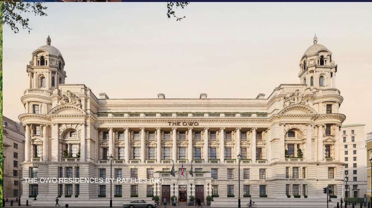
THE OWO RESIDENCES BY RAFFLES (UK)