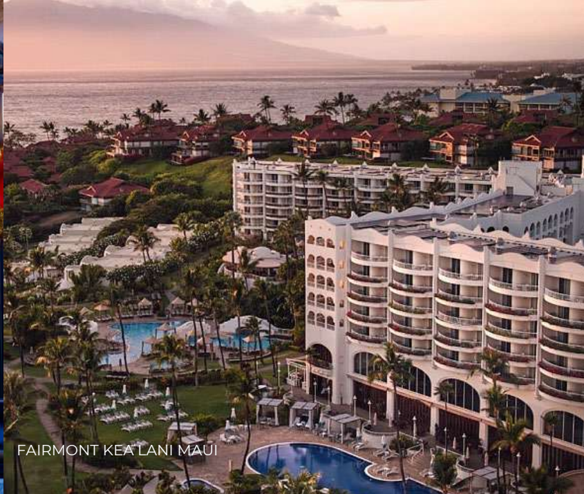
FAIRMONT KEA LANI MAUI