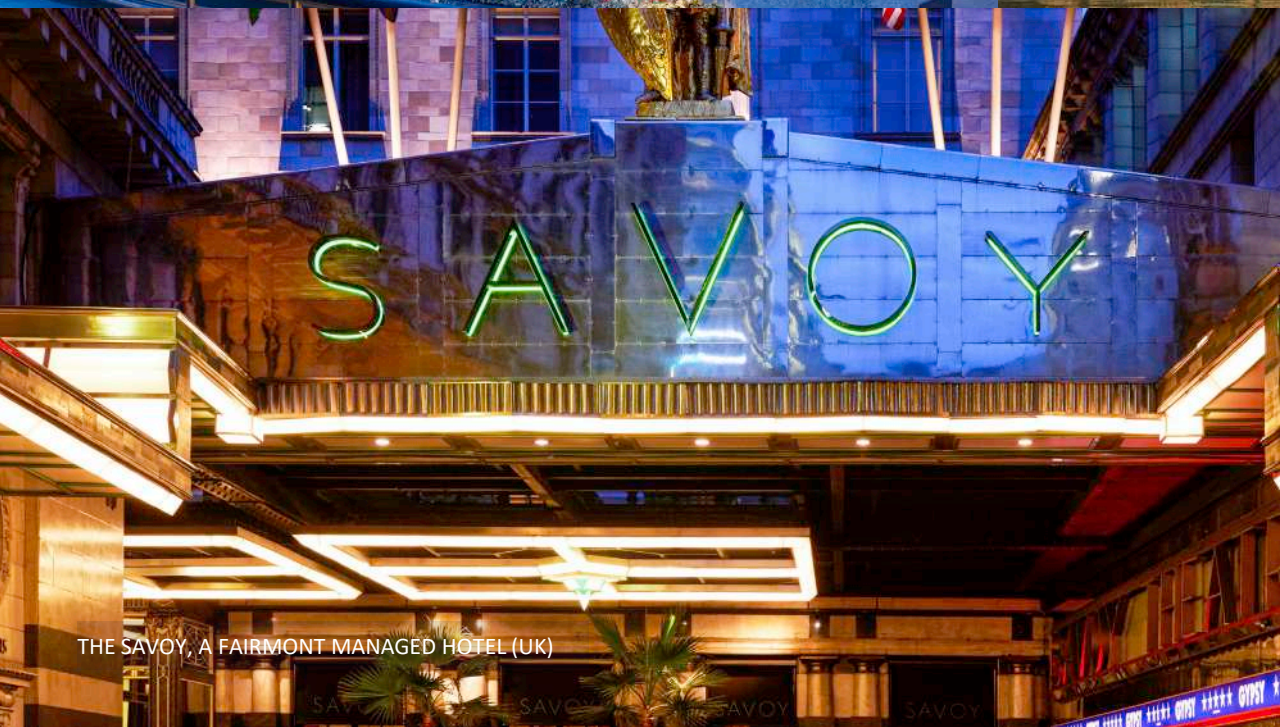
THE SAVOY, A FAIRMONT MANAGED HOTEL (UK)