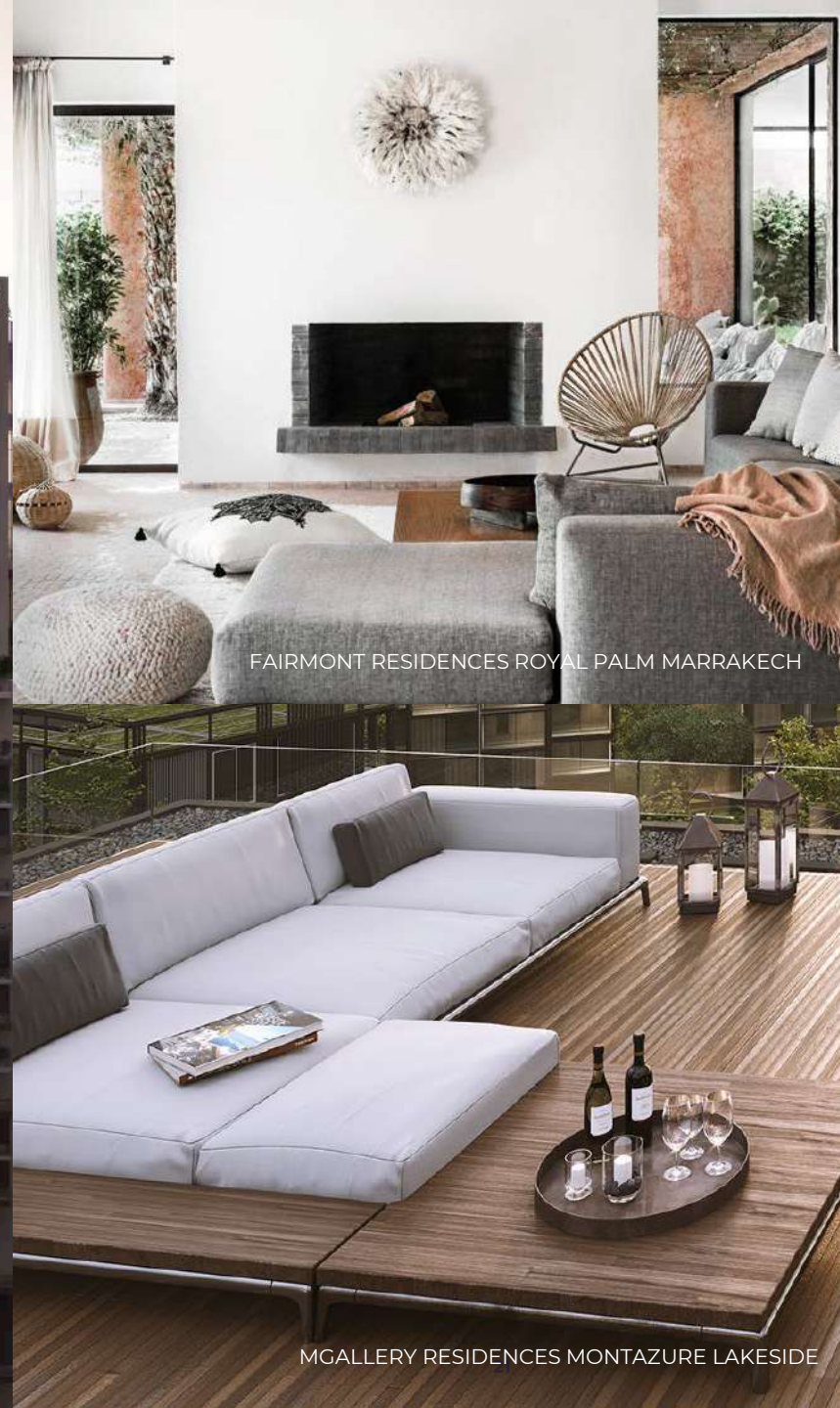
FAIRMONT RESIDENCES ROYAL PALM MARRAKECH