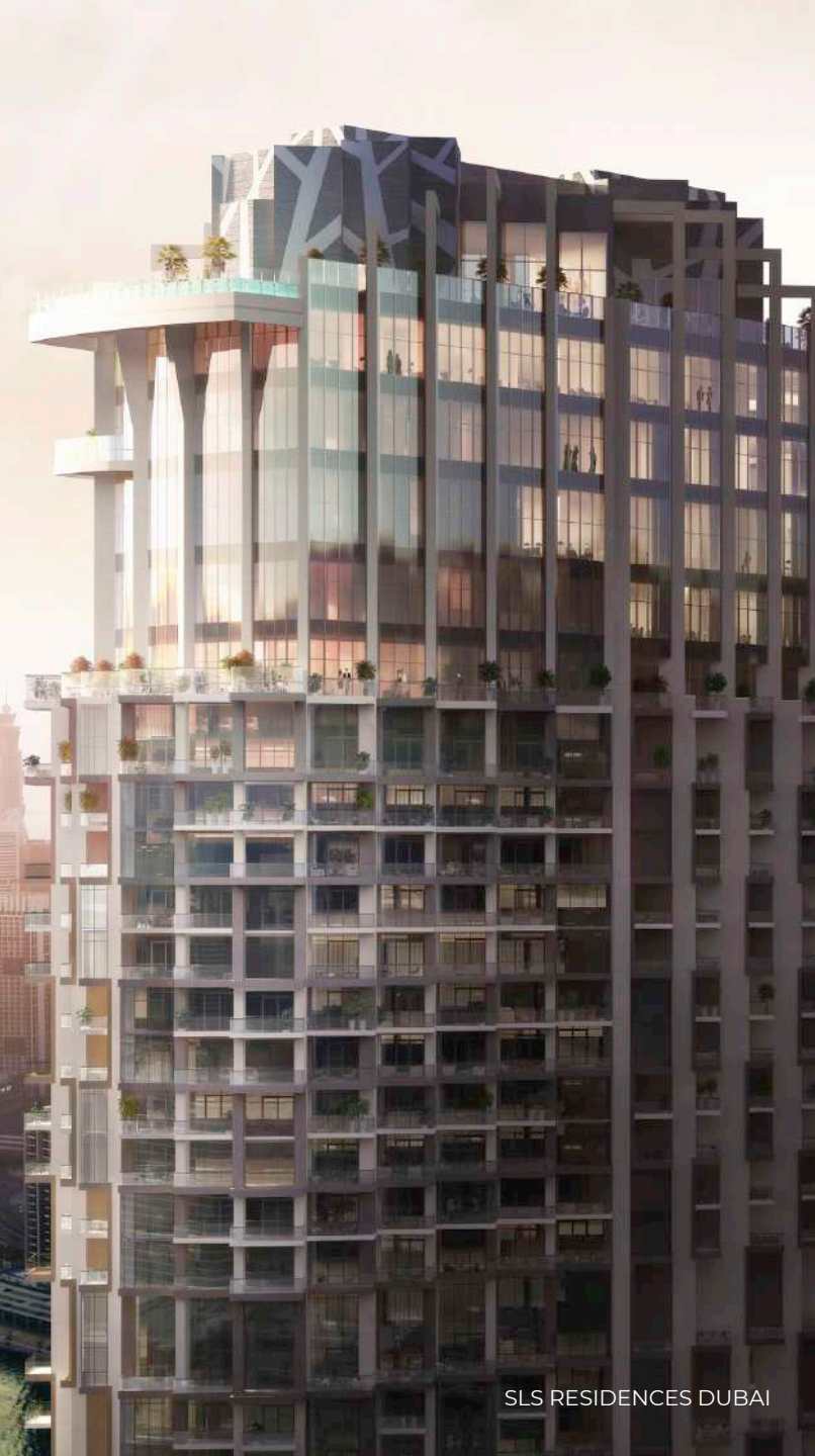
SLS RESIDENCES DUBAI