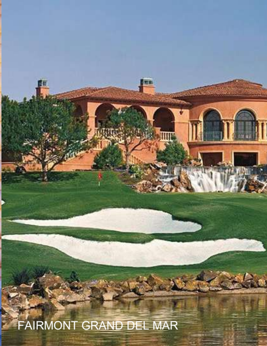
FAIRMONT GRAND DEL MAR