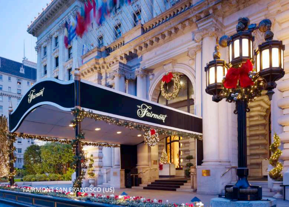
FAIRMONT SAN FRANCISCO (US)