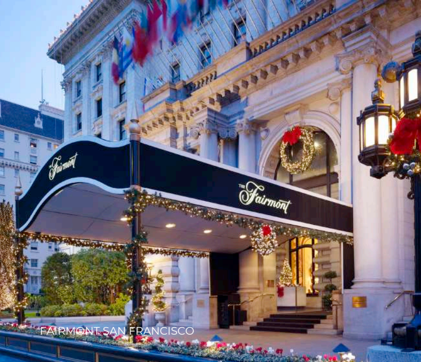
FAIRMONT SAN FRANCISCO